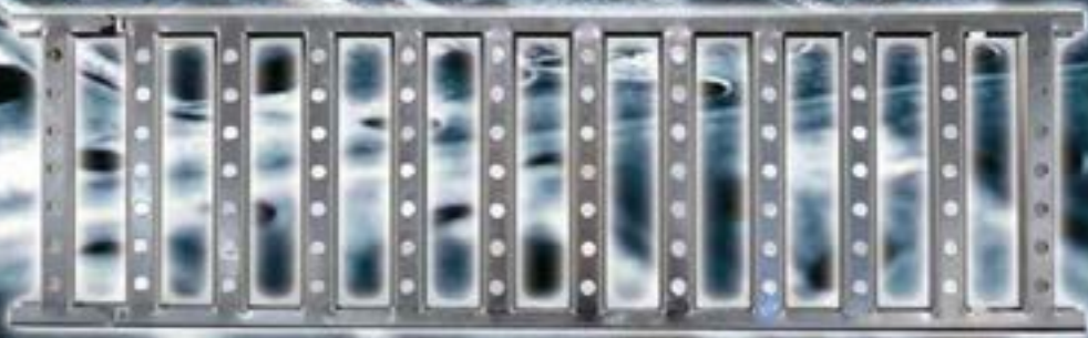
PARTHENON® Support Profile