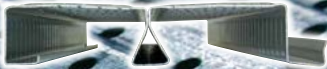
Brock TRI-CORR® Floor Profile

Featuring BROCK's Super Strong TRI-CORR® Bin Flooring and PARTHENON® Support for Bin Aeration Floor Systems