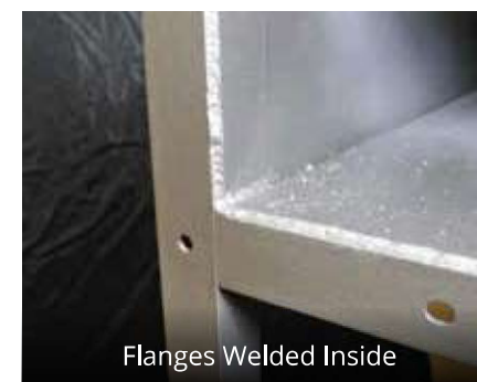
Flanges Welded Inside