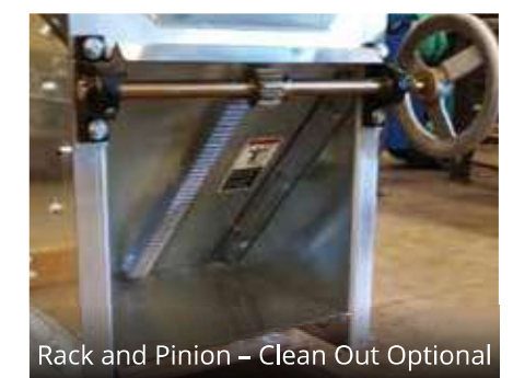
Rack and Pinion - Clean Out Optional