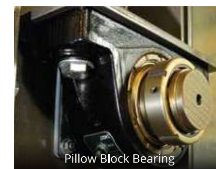
Pillow Block Bearing