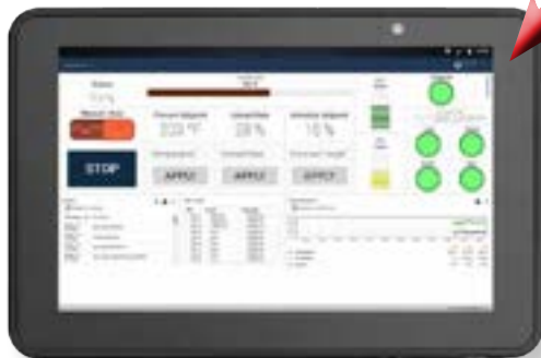
Tablet and Smartphone Displays