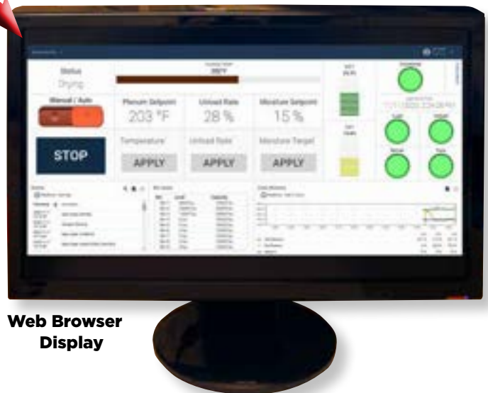
Web Browser Display

The OVERVIEW screen gives you a snapshot of dryer operation and performance. Its large, 15.6 inch touch screen provides user-friendly dryer setup and operation. Find what you are looking for quickly and easily.