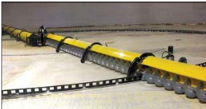
Sprocket Rail Drive provides smooth, efficient sweep movement. Dual arm option provides MAVERIK® HTF Single Pass. Swept Twice.™ clean-up.