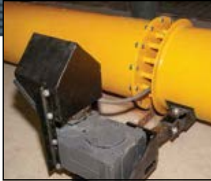
Rugged Drive System with positive sprocket rail drive for no-slip operation and more pushing torque.