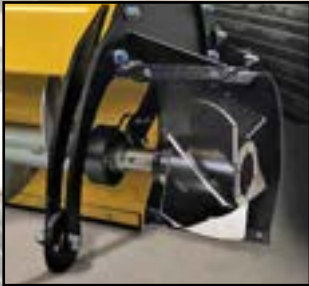
Adjustable Bin Wall Agitator