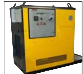
All-Hydraulic Sweep with advanced variable-speed technology optimizes time and productivity and can be operated remotely.