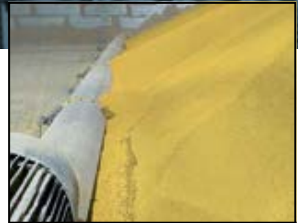
Forward Motion Auto Drive for True Zero Entry is standard to manage grain avalanches and compacted grain without the need to reverse.